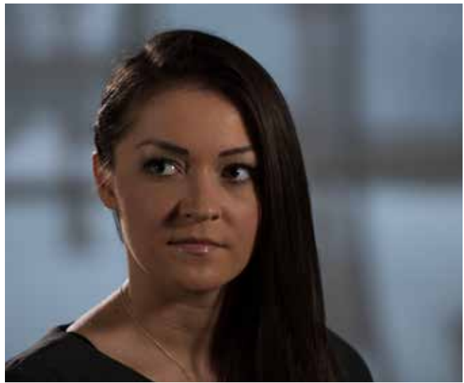
Picture printed on gel, combined with gobo (window). Identical setup, easier to perform with DLED3, otherwise identical.