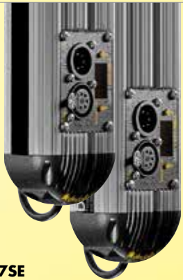
DLED7SE as DMX Version