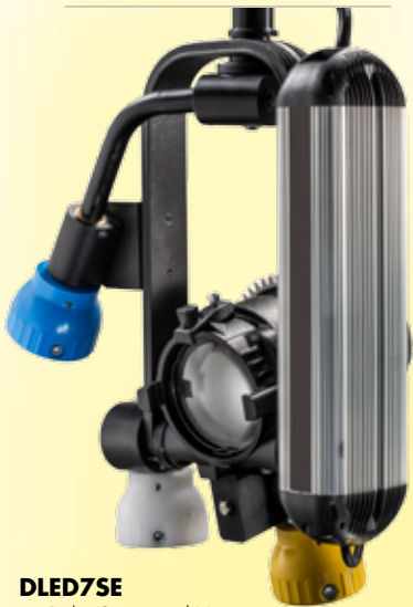
DLED7SE as Pole Operated Version