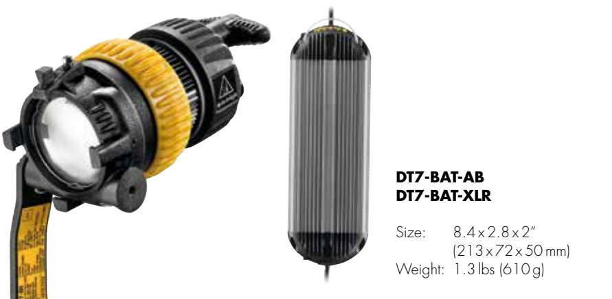
DT7-BAT-AB DT7-BAT-XLR Size: 8.4 x 2.8 x 2" (213 x 72 x 50 mm) Weight: 1.3 lbs (610 g)