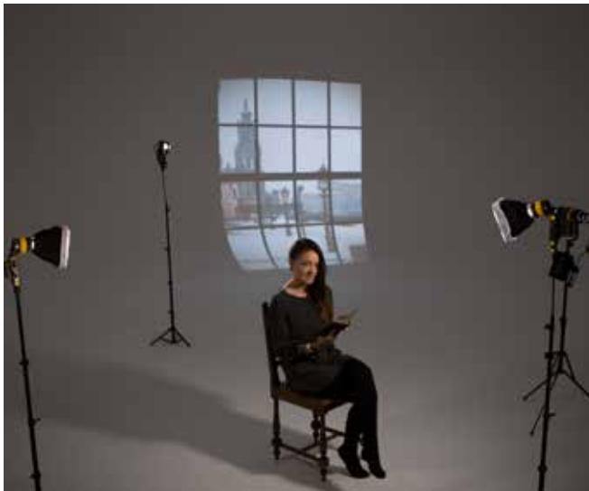
Picture shows setup with 3 DLED3 Turbo, 40W lights with integrated electronics, battery driven, background projection with DLED4 (40W), light head plus imager.