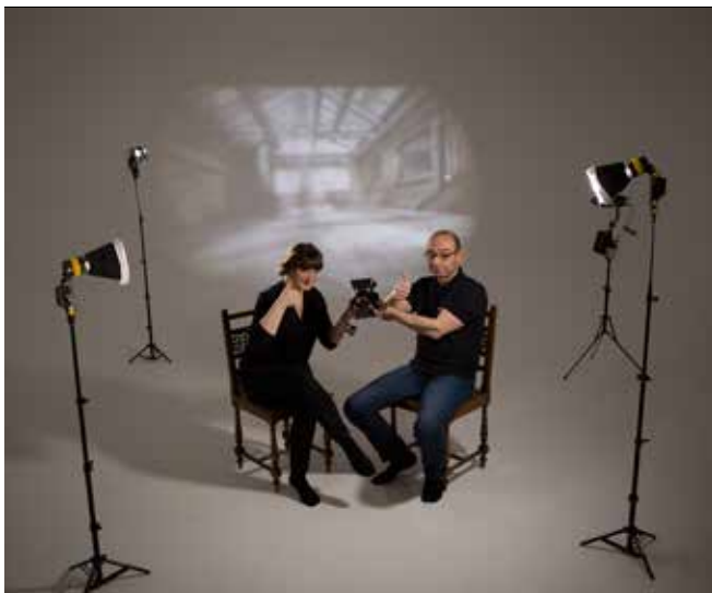
Picture shows setup as described above. Background projection from printed gel image.