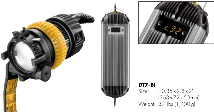
DT7-BI Size: 10.35 x 2.8 x 2" (263 x 72 x 50 mm) Weight: 3.1 lbs (1,400 g)