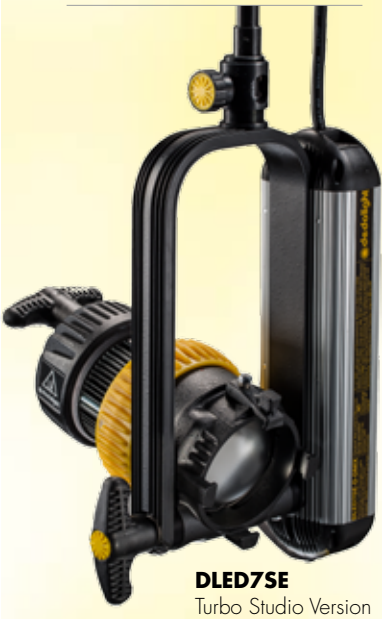
DLED7SE Turbo Studio Version