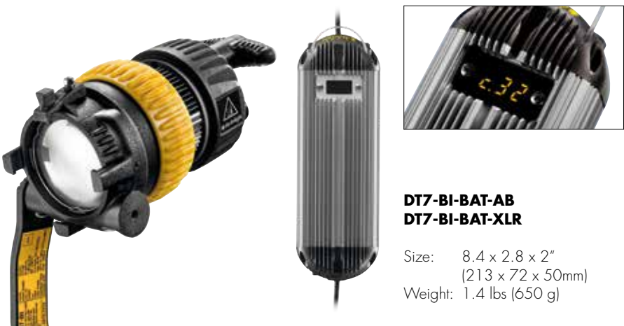
DT7-BI-BAT-AB DT7-BI-BAT-XLR Size: 8.4 x 2.8 x 2" (213 x 72 x 50 mm) Weight: 1.4 lbs (650 g)