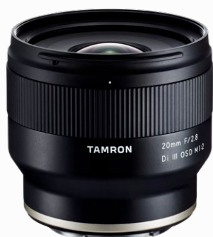
20mm F/2.8 Di III OSD M1:2 (Model F050)