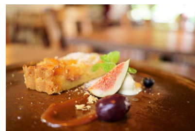
Focal Length: 35mm Exposure: F/2.8 1/25sec ISO:800

The MOD (Minimum Object Distance) for the 20mm, 24mm and 35mm is 0.11m, 0.12m and 0.15m (4.3, 4.7 and 5.9 in) respectively. Plus, the maximum magnification ratio for all three is 1:2 so you can fill the frame, even when shooting small objects. You'll never again be frustrated because you cannot get close to an object while shooting. This remarkable performance allows users to create compositions that exploit dramatic perspective (closer subjects are larger, and distant ones are smaller). With a fast F/2.8 aperture you can produce a one-of-a-kind photo and leverage the beautifully blurred background bokeh.