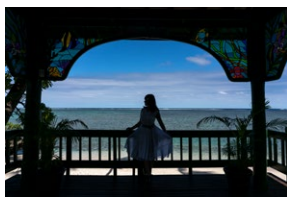
Focal Length: 24mm Exposure: F/10 1/1250sec ISO:200