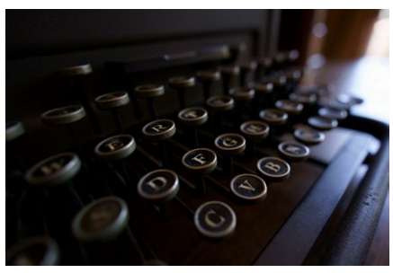
Focal Length: 17mm Exposure: F/2.8 1/100sec ISO: 400

The 17-28mm zoom features a MOD (Minimum Object Distance) of 0.19m (7.5 in) at the wide 17mm end, rendering a maximum magnification ratio of 1:5.2. At the tele end, the MOD is 0.26m (10.2 in) and the maximum magnification ratio is 1:6. You can easily get close for a powerful shot. Plus, you can produce soft expressions with a shallow depth of field distinctive to large aperture lenses by fully opening the aperture when shooting close to the subject.