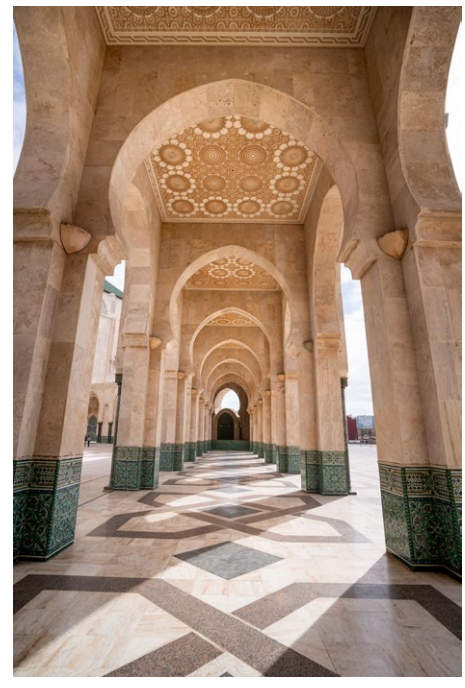
Focal Length: 17mm Exposure: F/4 1/1000sec ISO:100