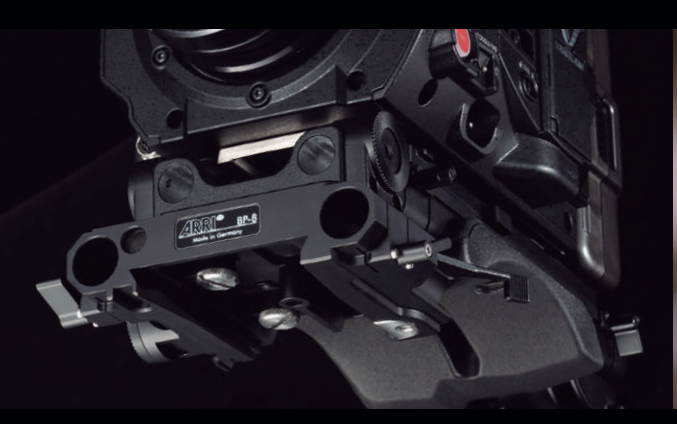
The New Shoulder Mount with a Base Plate.