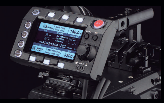
Detachable Control Panel with Monitor