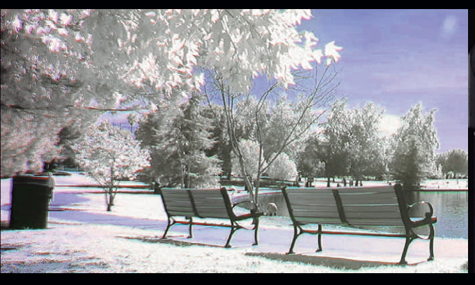
IR Shooting in Daylight