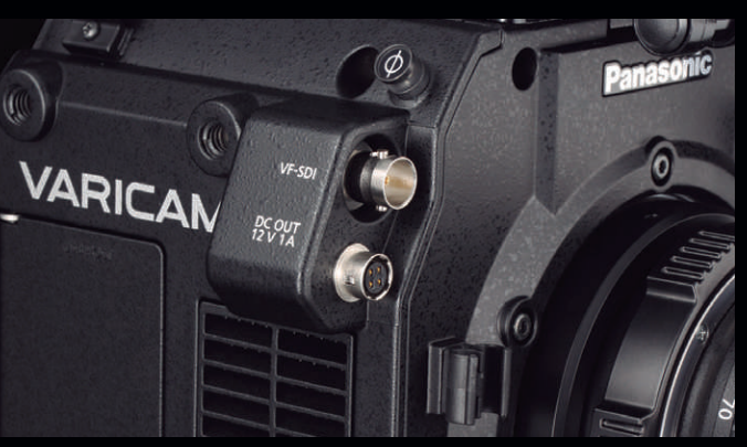
EVF Connections with HD SDI and DC Power