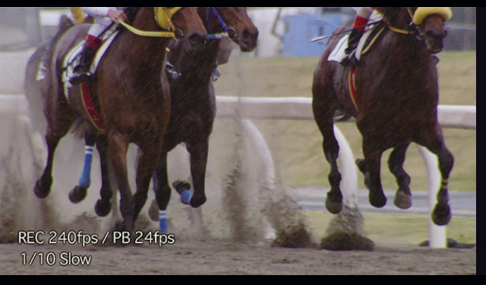
2K/240p Slow Motion