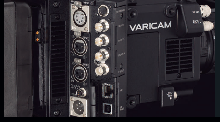
Rear Side Connectors