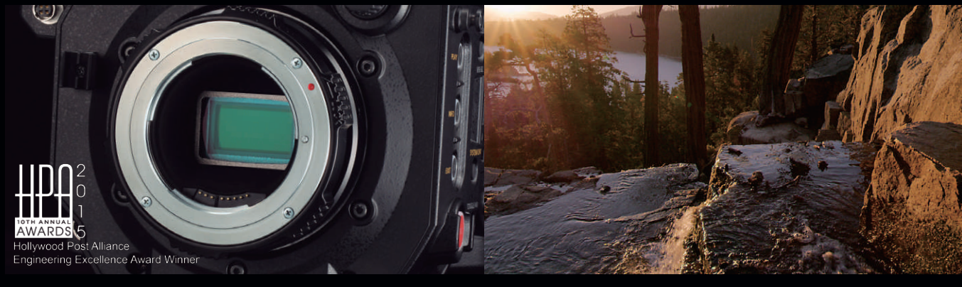
Super 35 mm Imager and EF Lens Mount*

The VariCam LT provides down conversion to Full HD via two 3G HD SDI outputs and one VF output (BNC) while shooting in 4K. Your look with in-camera color grading and information overlay can be applied to each output.