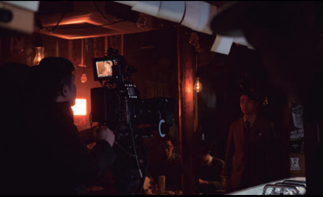
Dual Native ISO of 5000