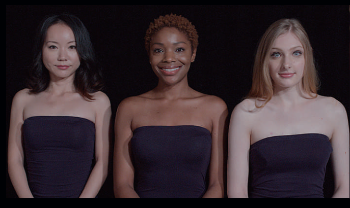
Beautiful Skin Tone