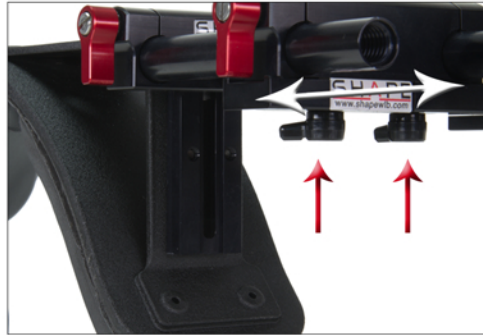
ADJUSTABLE KNOBS FOR SIDEWAY POSITIONS