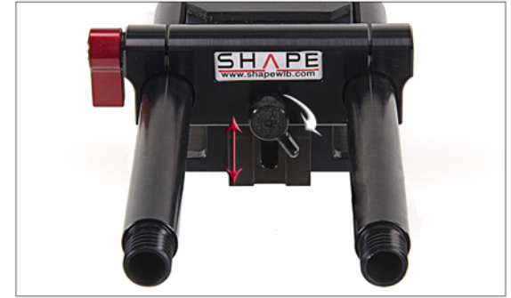
ADJUSTABLE KNOBS HEIGHT POSITION