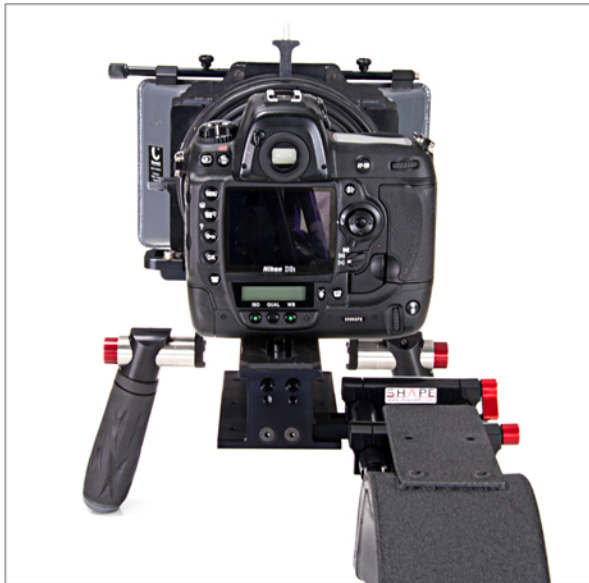
REAR VIEW IN OFFSET POSITION