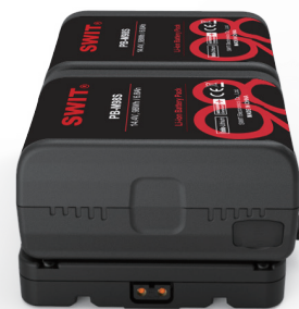
Compact and balanced