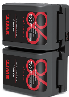
Fit 2x PB-M98S batteries 98Wh+98Wh=196Wh