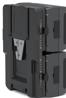
Power/hot swap indicators for each battery