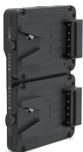
KA-M20S Hot swap plate