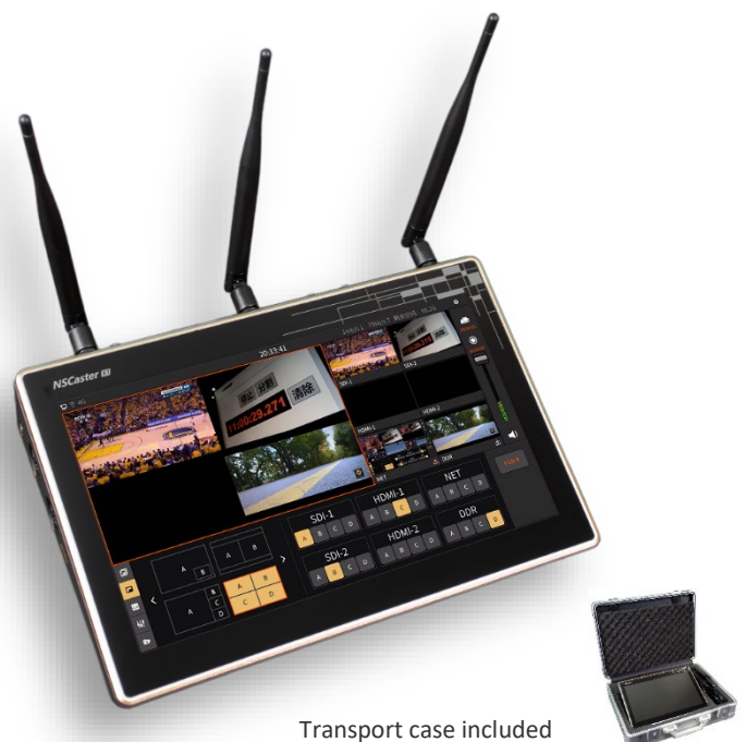
Transport case included